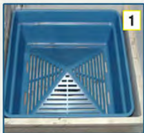
1 Place strainer in mop sink