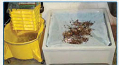
When filter gets full of debris, throw away and replace with a new filter, keeping mop sinks clean and free from drain clogs!