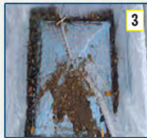
3 Dump dirty mop water onto filter and watch how much debris it captures!