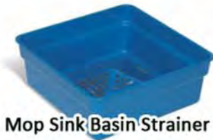
Mop Sink Basin Strainer

Every facility that has a mop sink, knows that this area is prone to drain clogs and plumbing problems due to the amount of dirt, trash, and other debris that goes down this drain. We have solved this problem with the Mop Sink Basin Strainer.