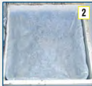
2 Place fine mesh filter on the strainer