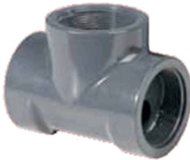
Flow Control included with shipment

Certified to the exact standards of PDI and listed by other local code authorities and national standards groups such as IAPMO and UPC.