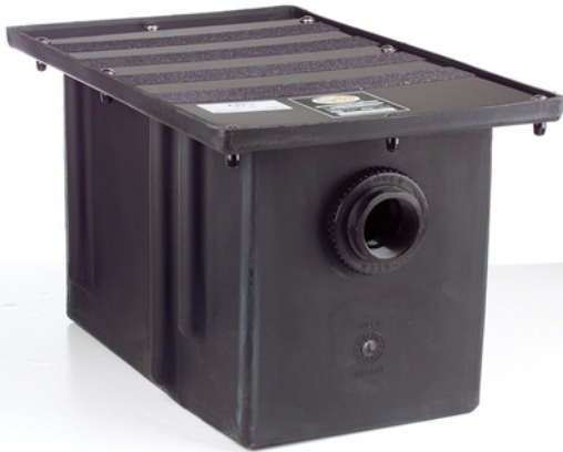
Serviceable Bulk Head Fittings available in 2" & 3"